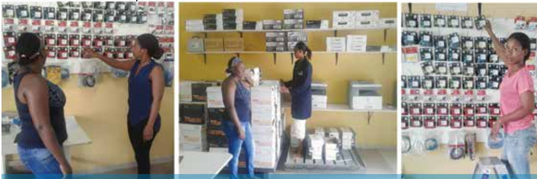
Operating days: Mon - Friday 06H45 - 18H00 Saturday: 07H30 - 15H00 Sunday and Public Holiday 8h00 - 13h00

Tinya-Ink Solutions, Outapi Branch, Shaanika Nashilongo Street, liyambo liyambo Complex Shop No: 1 Tel: +264 65 251263 Fax: +264 65 251303